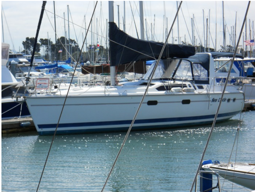
Commodore's New Boat