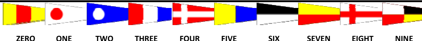
Course Chart IF-2018